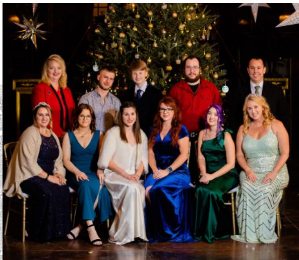
MAISON ALBION TEAM AT OUR ANNUAL FÊTE DE NÖEL 2021

Maison Albion is a physical embodiment of Western New York’s French influence. The natural charm and beauty of the property will be accented with light and airy French design and bright, cheery, and colorful gardens. This historic Albion mansion has been renovated and reinvigorated to ignite the romance and passion of its guests.