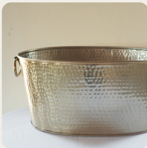
HAMMERED GOLD BEVERAGE TUB 19" x 14" x 9" 1 AVAILABLE $10/EACH