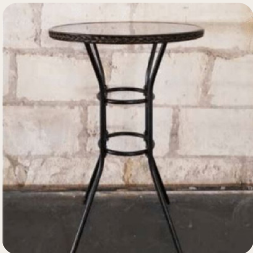
METAL COCKTAIL TABLE 28"W x 41"H 4 AVAILABLE $25/EACH