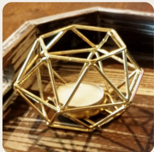
GOLD GEO VOTIVE 4" X 2.5" 50 AVAILABLE $2/EACH