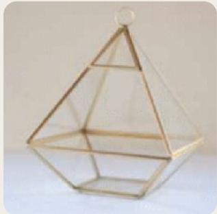
GOLD PRISM 8" X 6" 9 AVAILABLE $5/EACH