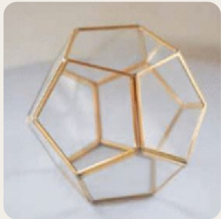
GOLD TERRARIUM 8" X 8" 15 AVAILABLE $5/EACH