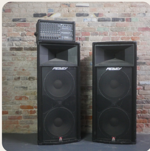
SOUND SYSTEM INCLUDES: 1 MICROPHONE 2 SPEAKERS 8 CHANNEL MIXER $200