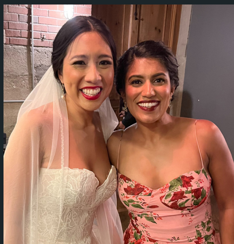
That's me in the floral dress!