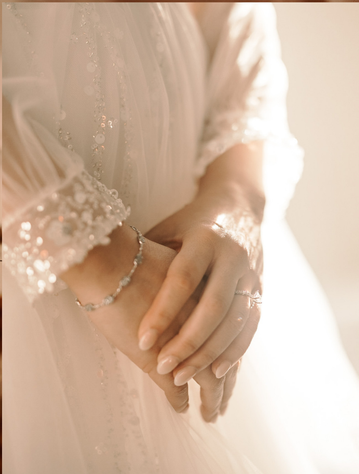
Oklahoma - Canon r5 / Kodak Portra 400