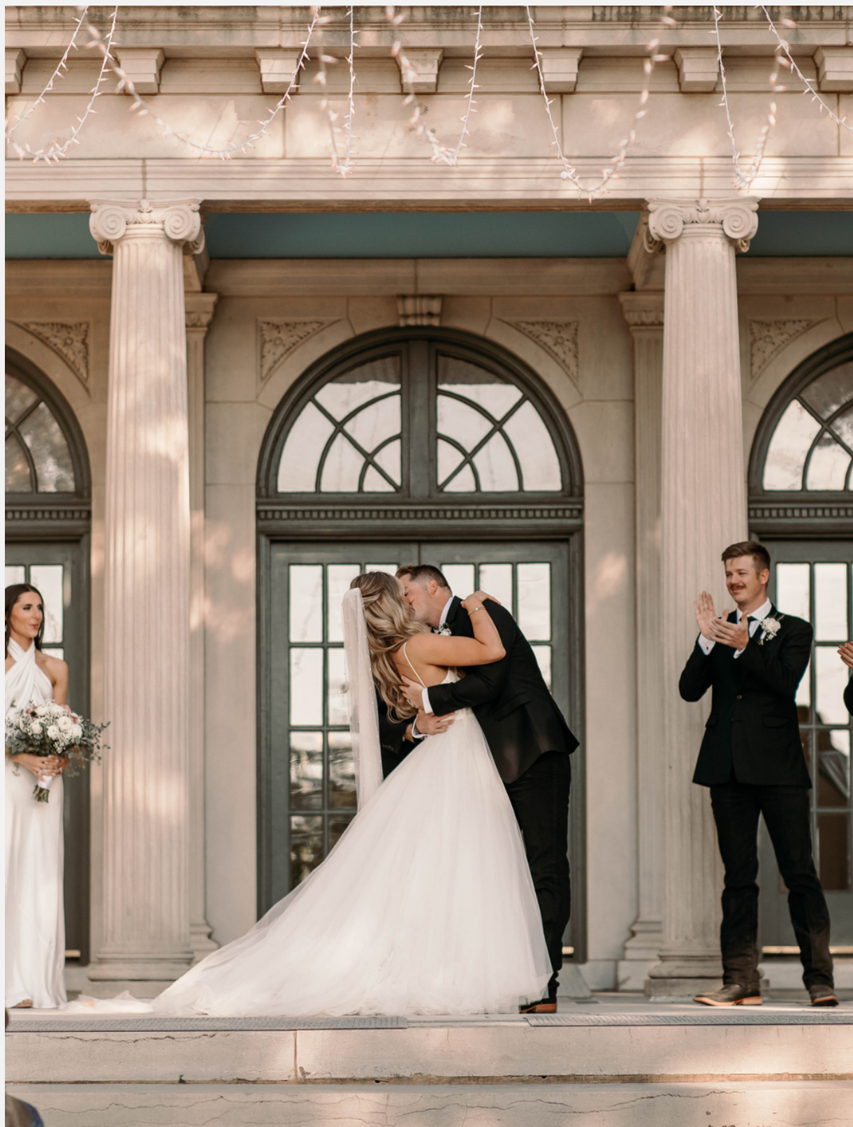
Tulsa, OK- 5D Mark IV | Kodak Portra 400