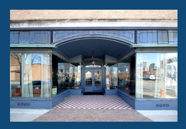
Is there parking available at the venue?

Yes! You are welcome to bring in wedding cakes / desserts. All other food and beverages must be purchased through The Kitchen.