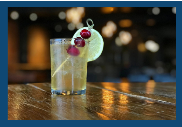
How are beverages charged for the event?

Yes, you are welcome to bring in your own decor. Please note that glitter, confetti and taper candles are not permitted. All candles must be enclosed in glass, such as a votive or a hurricane glass. If any of the prohibited items are brought in, you will be charged a damage fee.