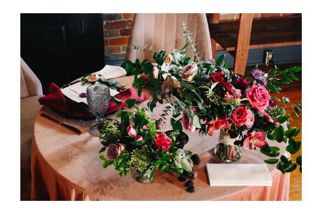
Will there be an Event Coordinator for my wedding?

We do! The list includes vendors we know and love and that are familiar with The Kitchen. You may choose from our list or choose other vendors for your event.