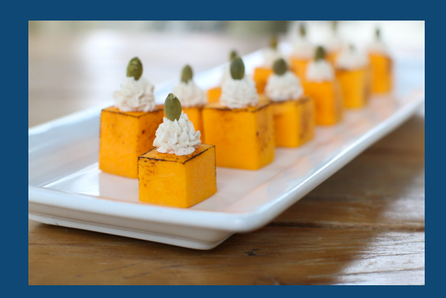
How is the menu served for the event?

Our beverages are charged based on consumption and the final beverage amount will be due the day of the event.