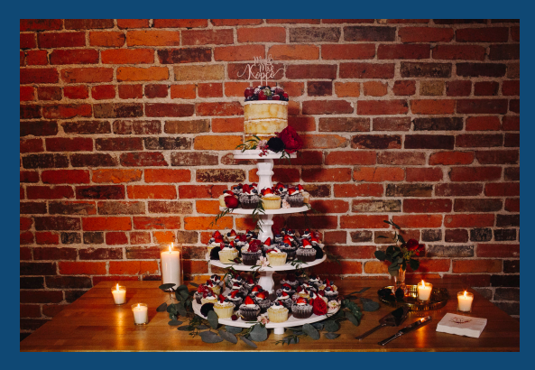
Can I bring in a wedding cake or dessert from an outside vendor?

Yes! The Kitchen provides an Event Coordinator that will be there for the wedding day to ensure everything runs smoothly and there is no extra fee for this.