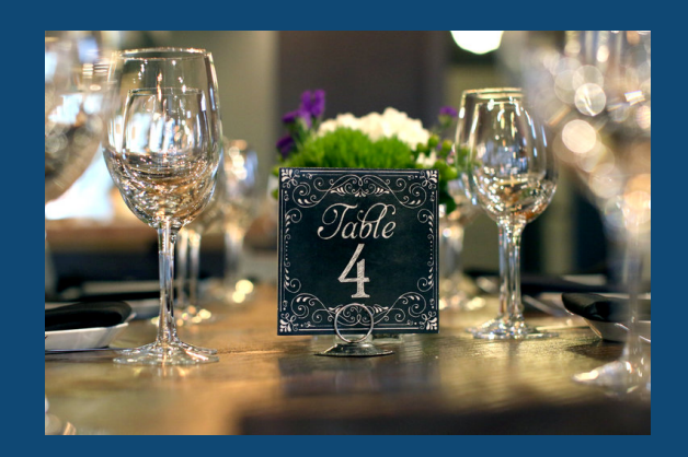
What is the payment schedule?

Yes! You may have your ceremony at The Kitchen and there is no extra fee for this.