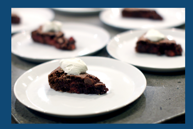
Is there a cake cutting or corkage fee?

Yes, we are more than happy to accommodate! All dietary restriction information is due when you submit your final event details 30 days before your event date.