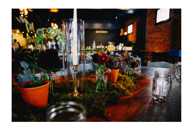
Am I allowed to bring in my own decor?

All event details (including final guest count, menu, and timeline) will be due 30 days prior to the event date.