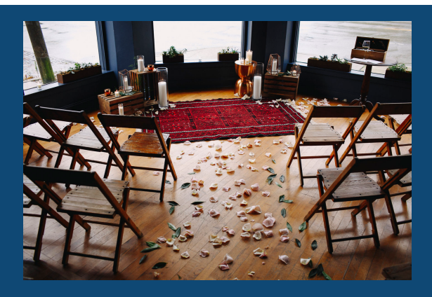
Can we have our ceremony at The Kitchen?

Yes! You may have your ceremony at The Kitchen and there is no extra fee for this.