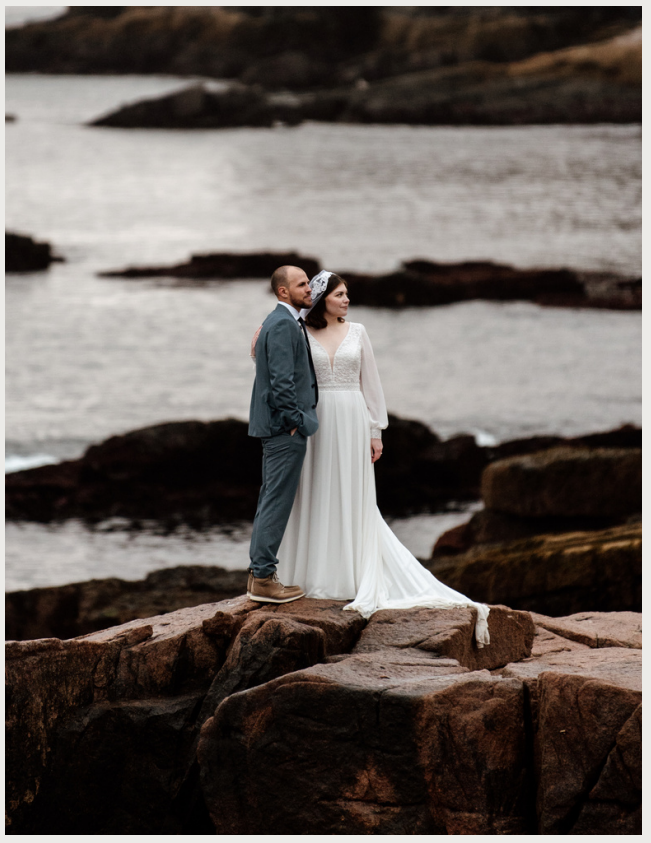
VIDEO - $1,850