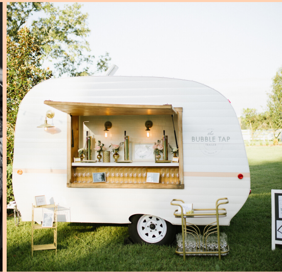
BUBBLE TAP TRAILER