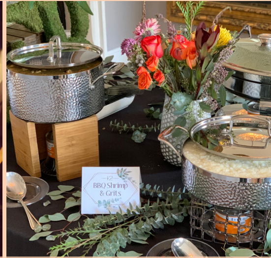
BBQ SHRIMP & GRITS