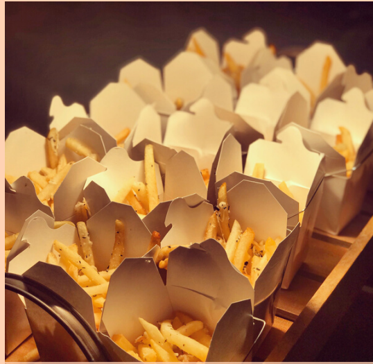
FRENCH FRY BAR