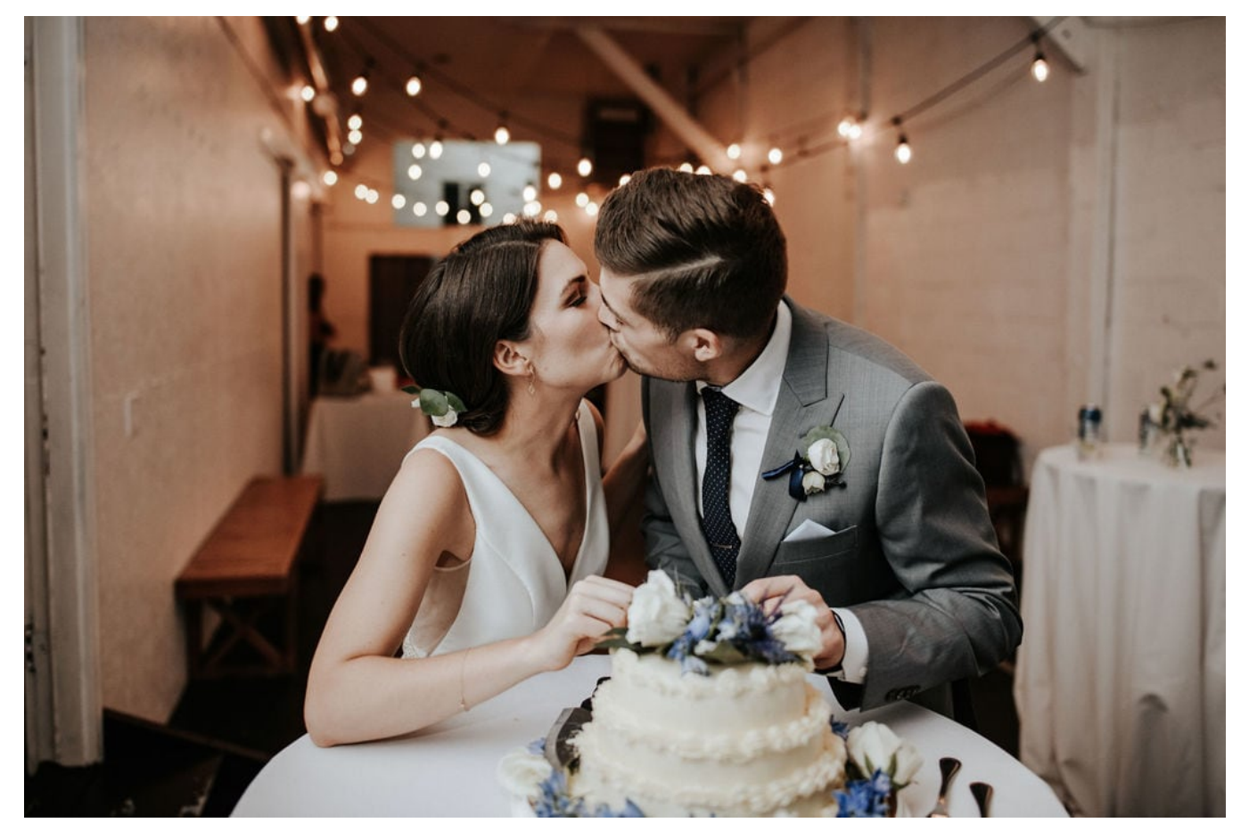
Congratulations on your engagement!

First of all, we wanted to say thank you SO much for considering us to host your wedding!