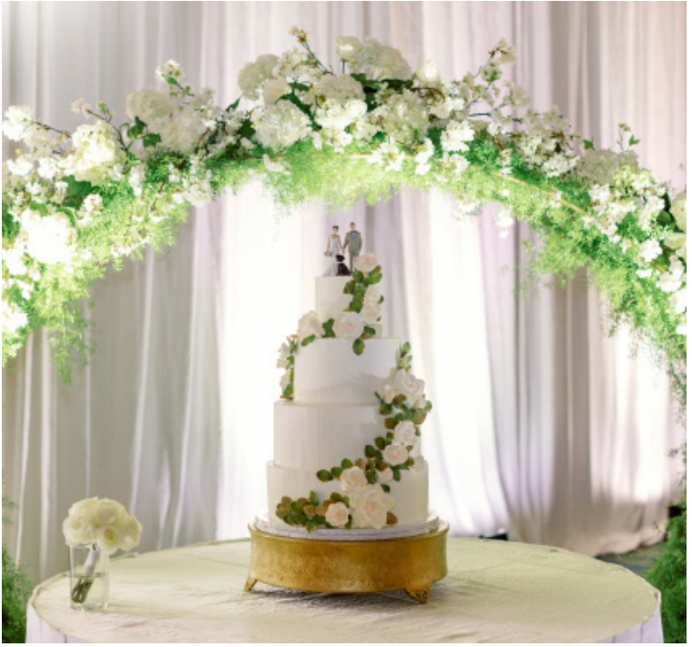
All pricing subject to 26% service charge plus tax.