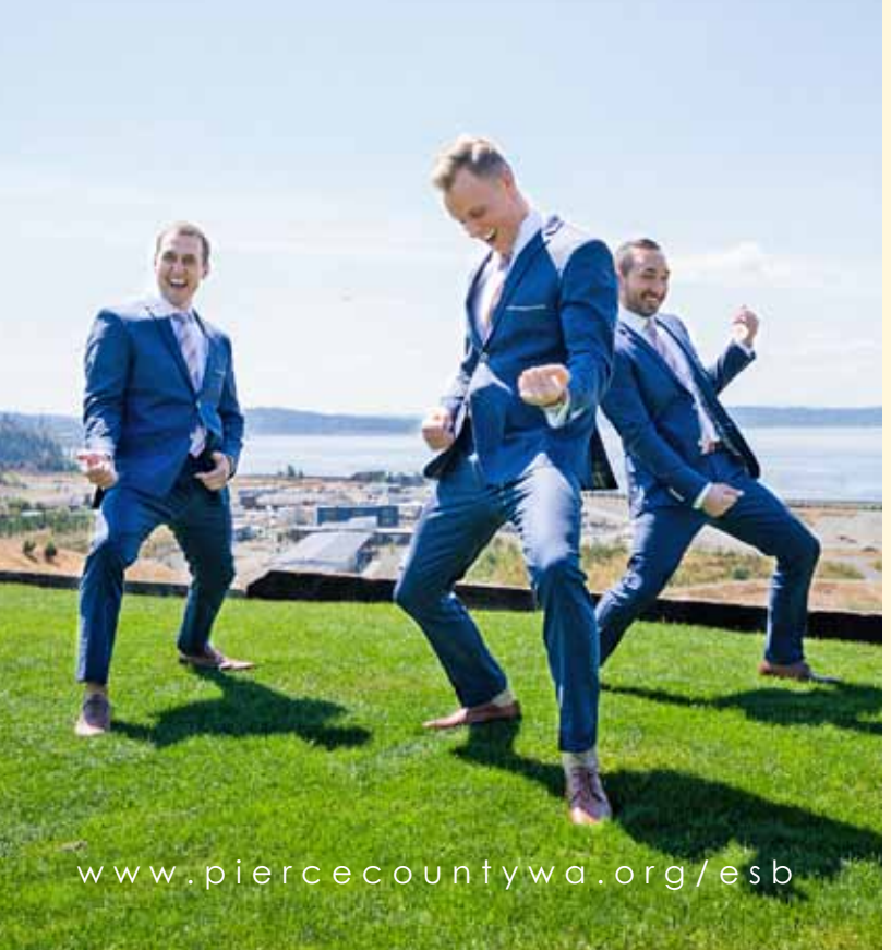
GREEN LAWNS AND SCENIC VIEWS