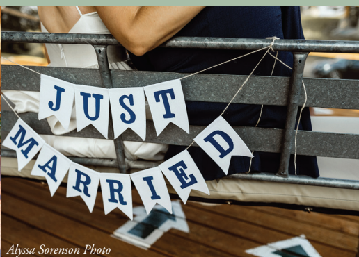
Alyssa Sorenson Photo