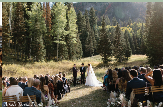
Asbely Teresa Photo