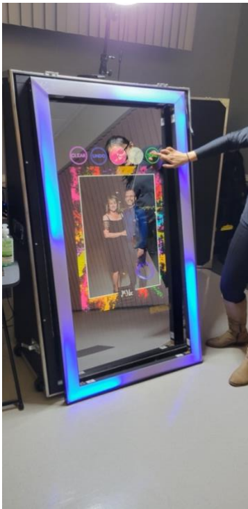
Photo Booth Services

If you want to leave a great impression on your guests, then our Mirror Me Photo Booth will certainly provide them the time and memories that they will talk about for a long time. We provide FREE 4x6 prints for your guests and customize our templates to each of our events. We provide a Mirror Me operator who will ensure every one of your guests enjoys their time taking pictures in a safe manner.