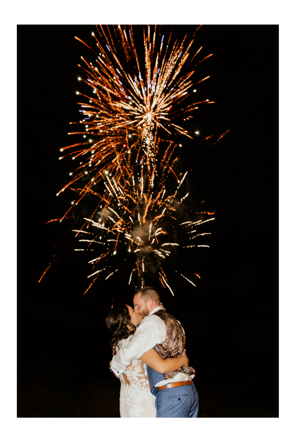
Y STUDIO PHOTOGRAPHY

I would love for you to share my images! Share away, but please make sure to tag us!