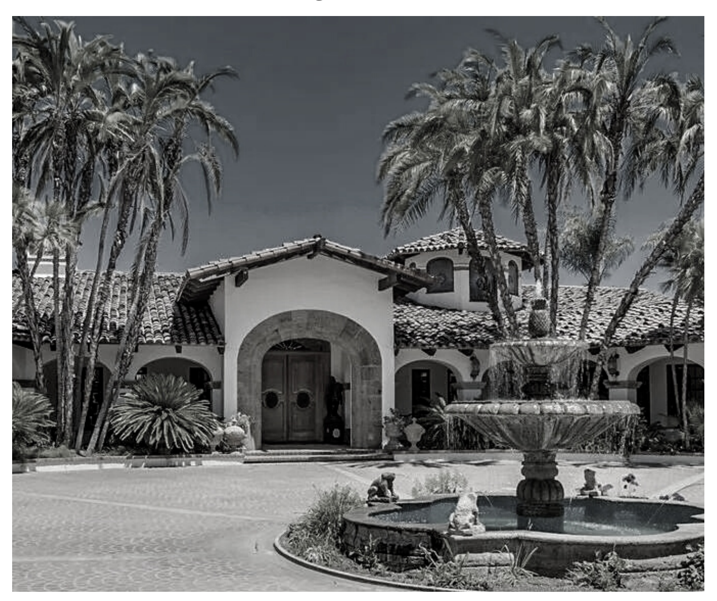
LUXURY PRIVATE MANSION | 40 ACRE RANCH | TROPICAL JUNGLE ESCAPE