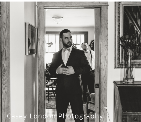
Casey London Photography