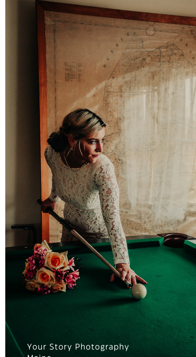
Your Story Photography Maine