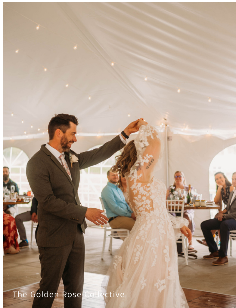
The Golden Rose Collective