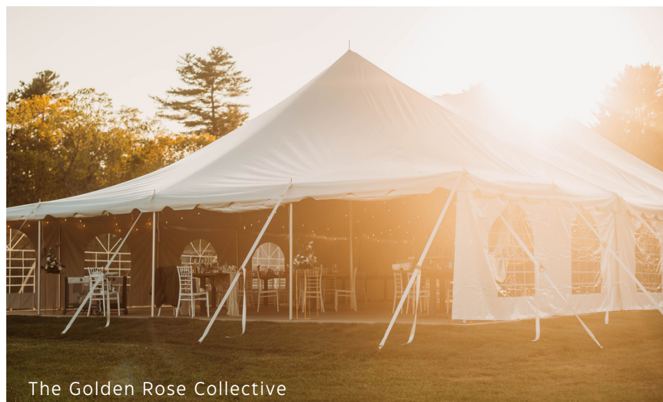
The Golden Rose Collective