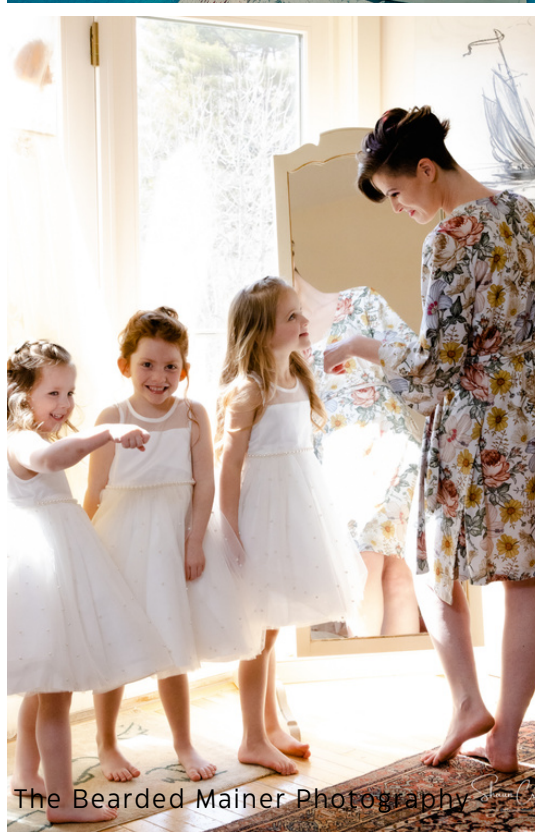
The Bearded Mainer Photography