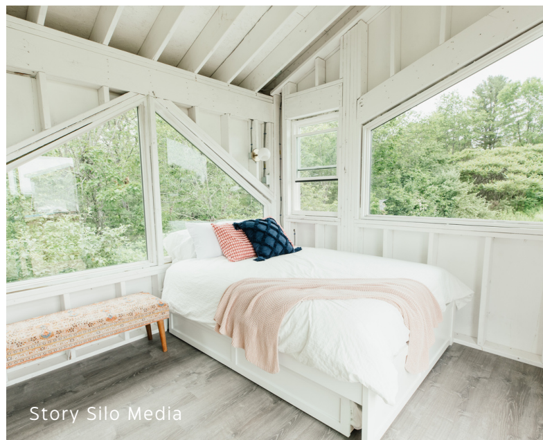
Story Silo Media