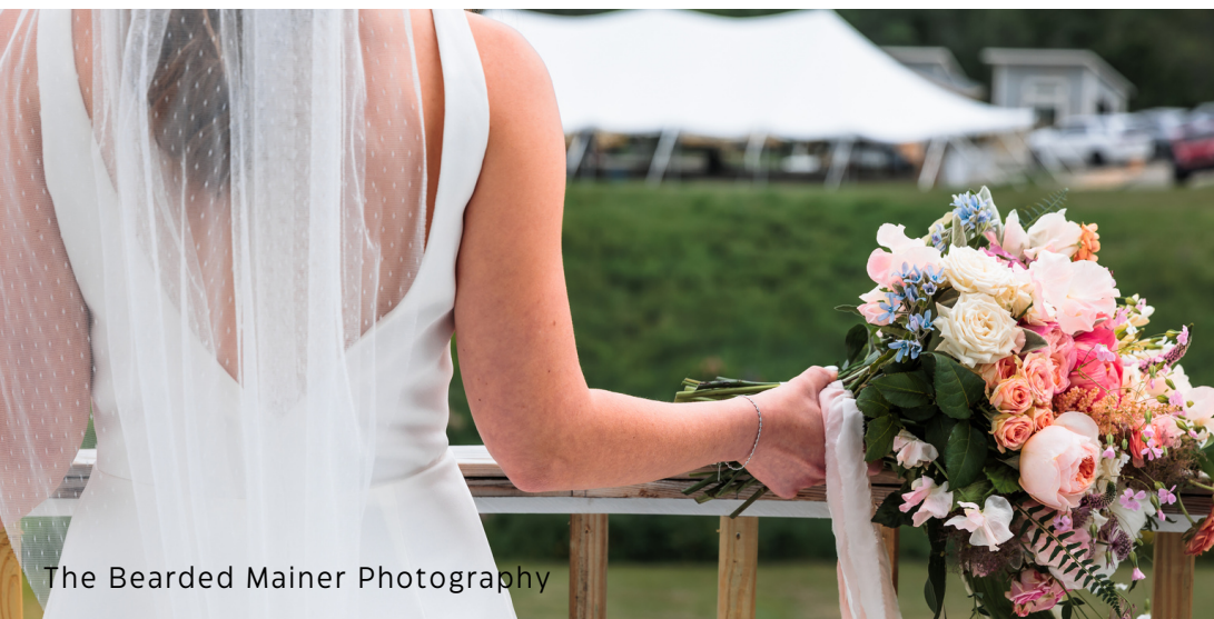
The Bearded Mainer Photography