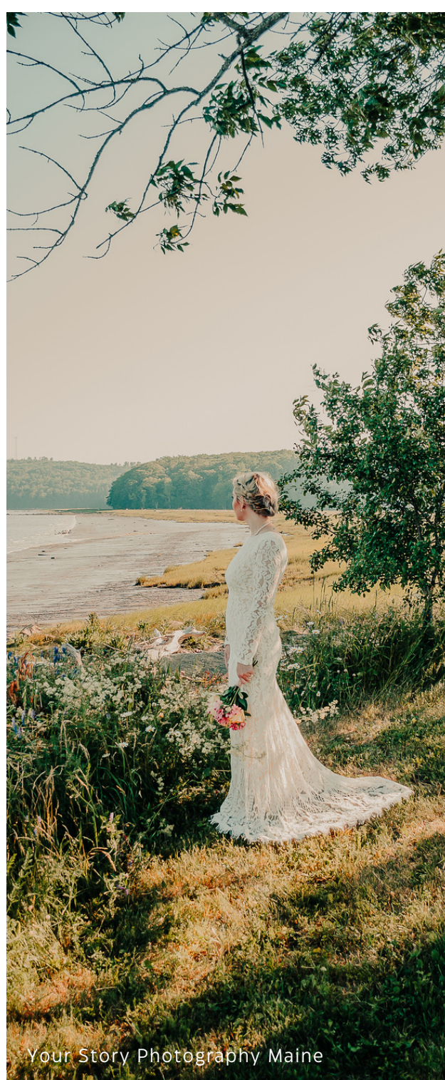
Your Story Photography Maine