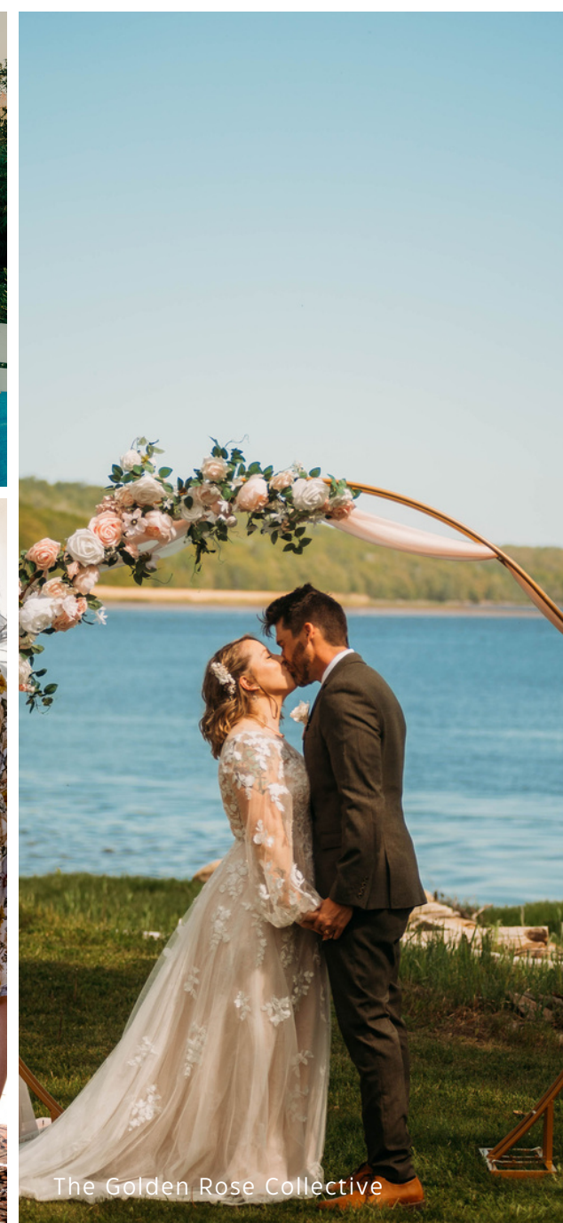
The Golden Rose Collective