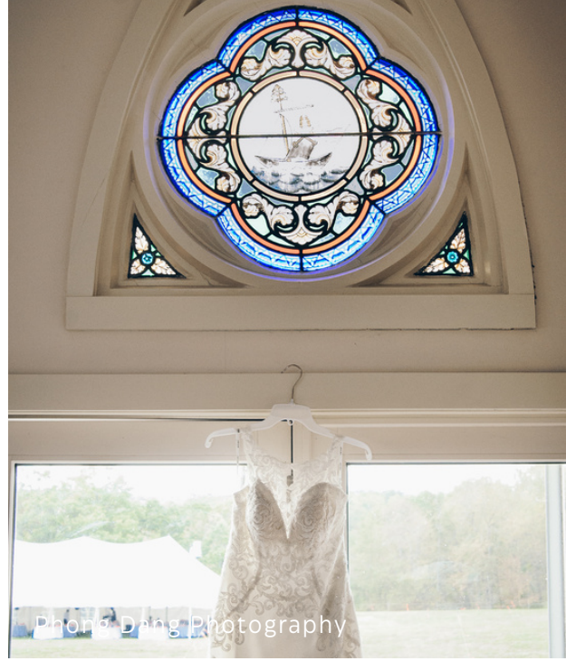
Phone D'ing Photography