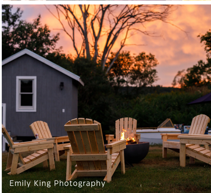
Emily King Photography