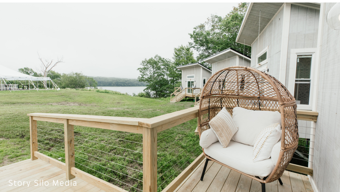
Story Silo Media