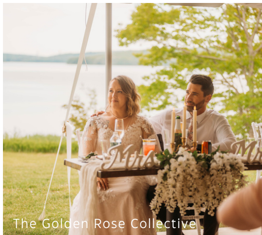
The Golden Rose Collective