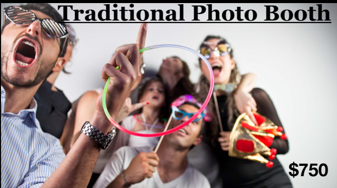
Photo Booth Services

*Pricing is based on venue requirements/quantity of fixtures needed. All Inclusive package rate $250