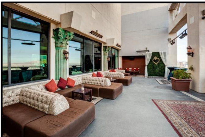
Mandalay Patio - View