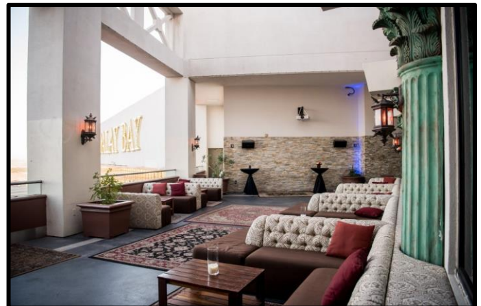
Mandalay Patio - Reception