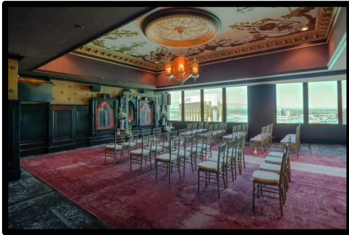
Shangri-La Ceremony (Upgrades Shown)