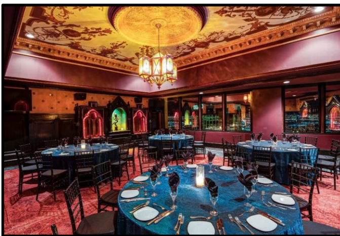
Shangri-La - Seated