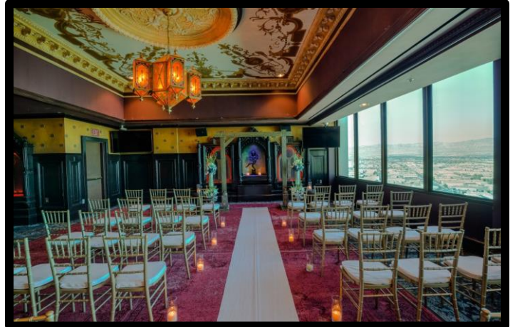
Shangri-La Ceremony (Upgrades Shown)