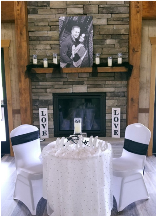
^ Indoor gas fireplace