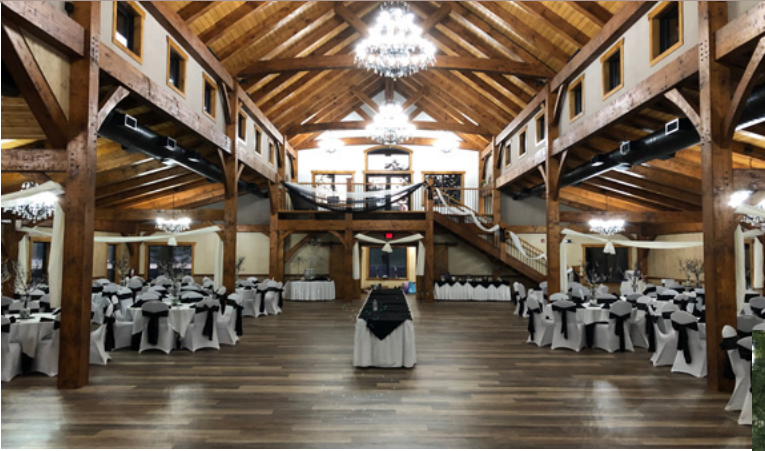
^ View from the stage