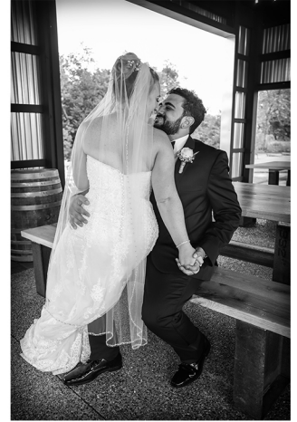
Independence Hall $1,450.00

(8) hours of photography coverage on day of event (1) photographer for the event (1) custom engraved USB with all edited images