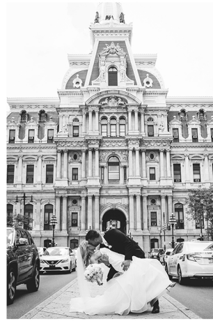
Times Square $2,100.00

Engagement Sitting at location of your choice* (8) hours of photography coverage on day of event (2) photographers for the event (1) custom engraved USB with all edited images