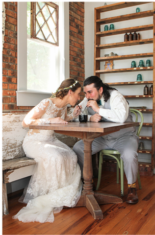
Golden Gate (OUR MOST POPULAR) $1,700.00

Engagement Sitting at location of your choice* (8) hours of photography coverage on day of event (1) photographer for the event (1) custom engraved USB with all edited images