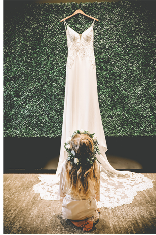
Central Park $1,200.00

(5) hours of photography coverage on day of event (1) photographer for the event (1) custom engraved USB with all edited images