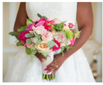
Month of Coordination 5-8 Weeks of finalizing your details

5-8 Weeks of finalizing your details Our average clients spend $1700-$2200* <u>Contact Us</u> for pricing