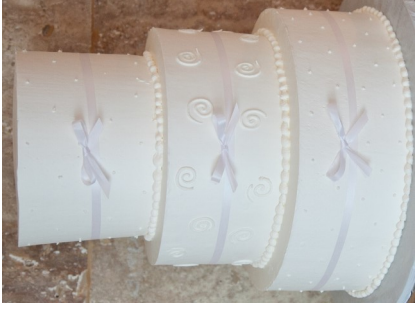
White Dots & Bows