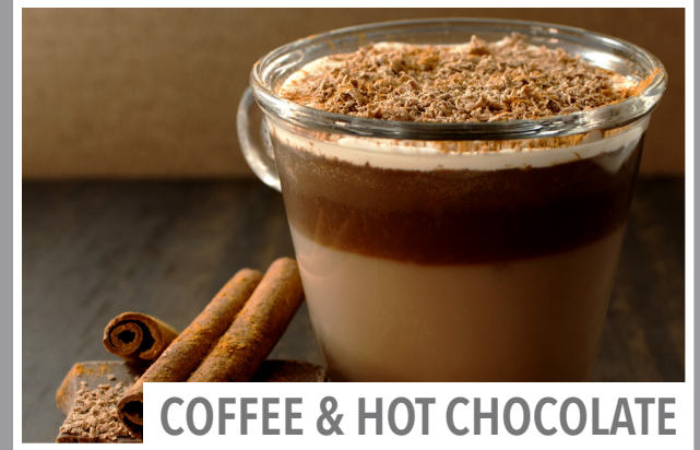
COFFEE & HOT CHOCOLATE