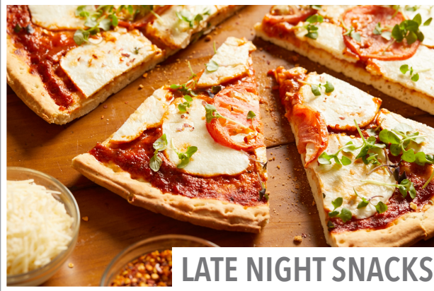
LATE NIGHT SNACKS