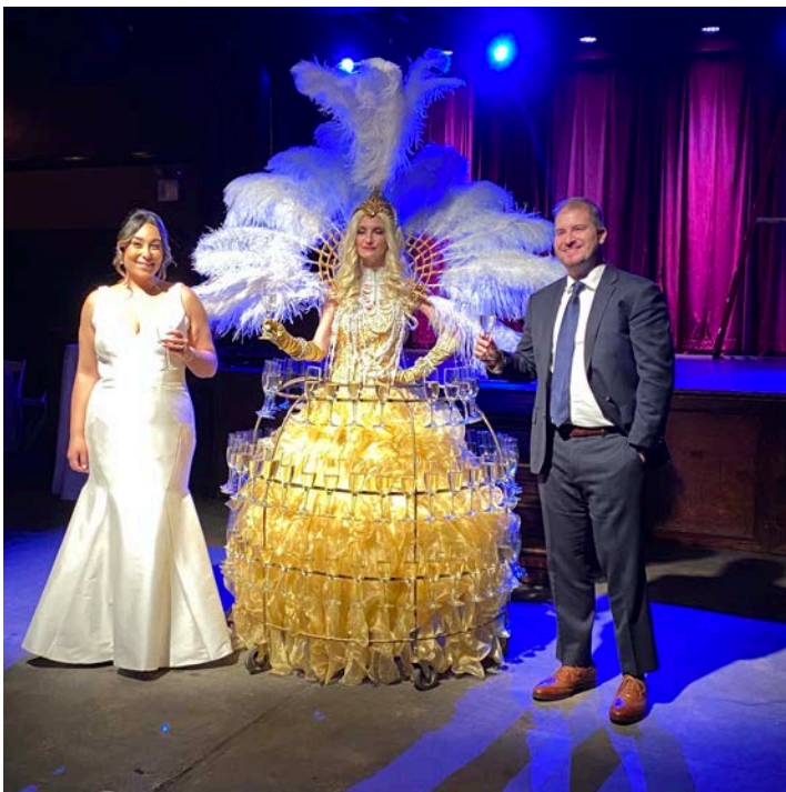
The Bell House, Brooklyn, NY