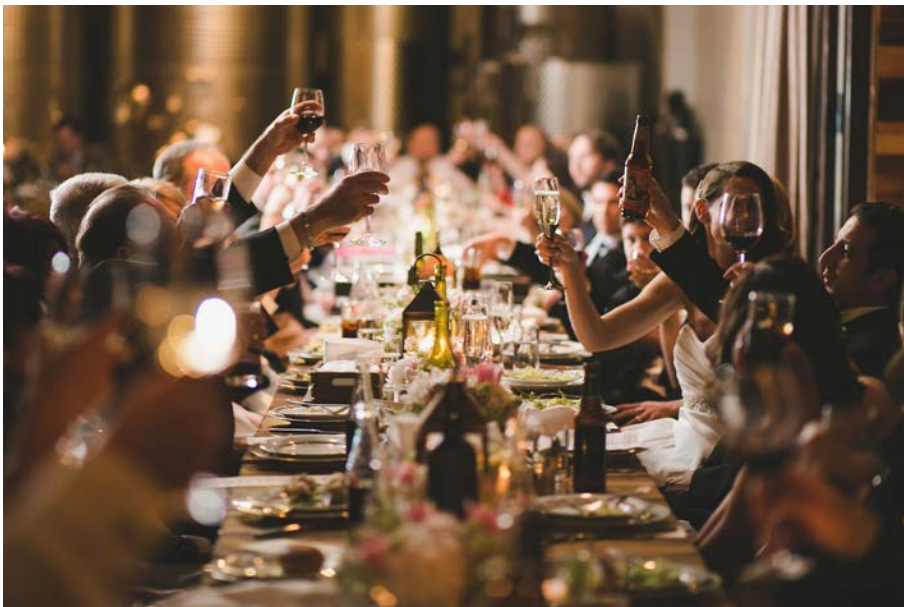
Brooklyn Winery, Brooklyn, NY