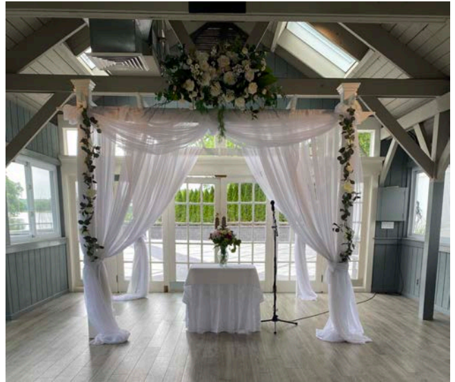
Swan Club on the Harbor, Roslyn, NY

Park Lane Hotel, New York, NY Four Seasons New York Downtown, New York, NY Tappan Hill Mansion, Tarrytown, NY Swan Club on the Harbor, Roslyn, NY Sunset Terrace at Chelsea Piers, New York, NY The Bell House, Brooklyn, NY Brooklyn Winery, Brooklyn, NY Oheka Castle, Huntington, NY Andaz Hotel, New York, NY The Box House Hotel, Brooklyn, NY Housing Works, New York, NY