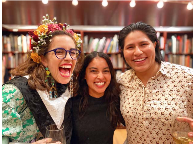
Housing Works, New York, NY