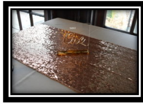
Table Numbers - $5.00/each Calligraphy clear acrylic signs with gold lettering