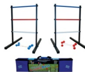
Lawn Games $100.00/set