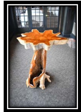
Unique Cake Table - $75.00 One of kind functional work of art made from genuine teak root wood. Warm, rich tones with stunning wood grains.