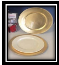
Gold Chargers $1.00/each