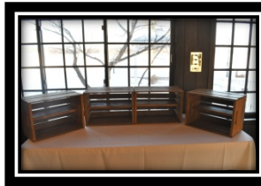
Wooden Crates $30.00/5 crates