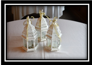
Rustic White Lanterns $5.00/each With gold accents