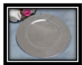
Silver Chargers $1.00/each