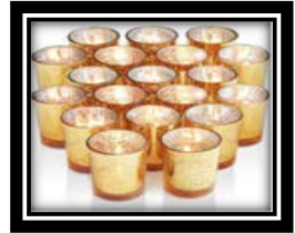
Speckled Gold Votive Candle Holders $8.00/doz w/o candle $10.00/doz w/ candle