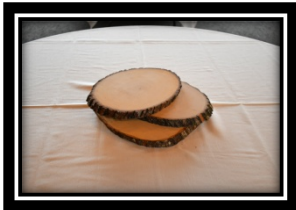
Wood Slabs - $15.00/dozen Thin, genuine wood