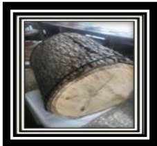
Wooden Card Box $25.00