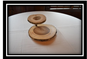
Two Tier Wood Display Stands $15.00/two stands