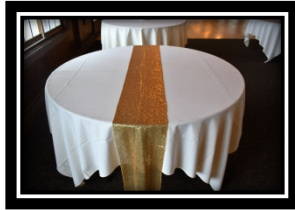
Table Runners - $4.00/each Available in gold and rose gold glitz