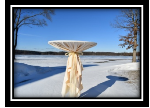
High Top or Bistro Tables $15.00/each