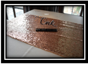
Table Numbers - $5.00/each Calligraphy clear acrylic signs with black lettering