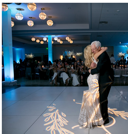
UPLIGHTING ON EVERY PILLAR PIN SPOTTING

VALET SERVICE Valet Parking quoted separately