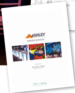
Ashley Furniture Annual Awards La Crosse Center South Hall