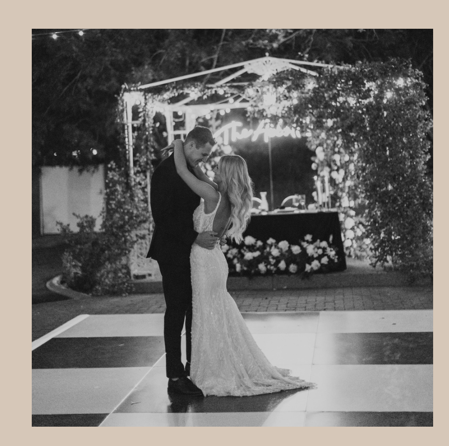
one. Schedule our Consultation Call