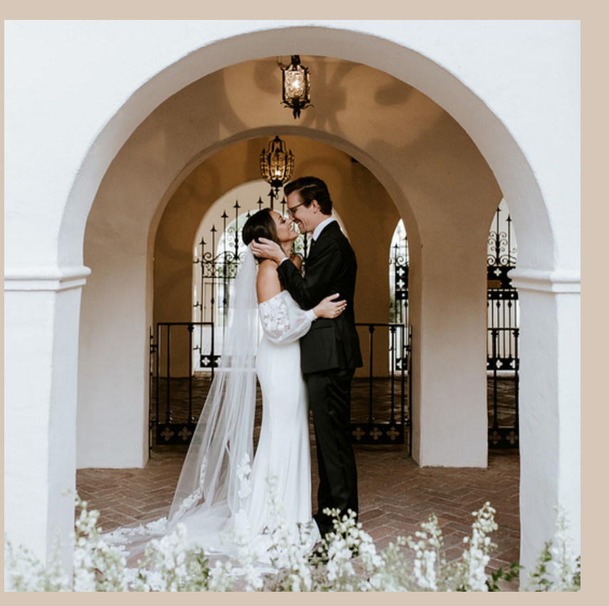
two. Complete Contract & Deposit