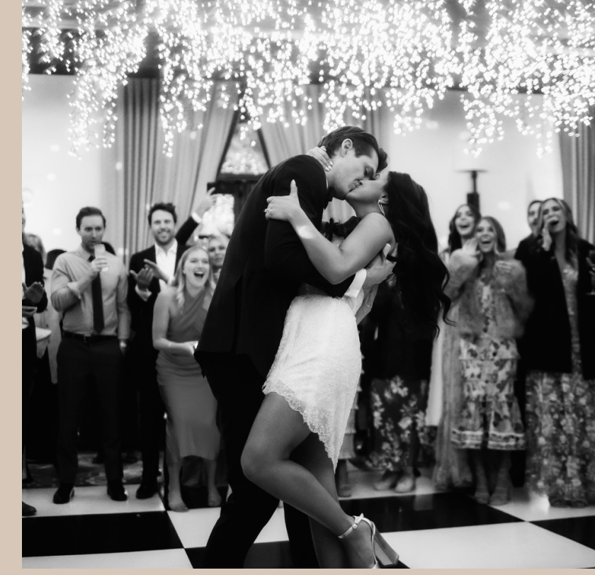
three. Schedule First Planning Meeting