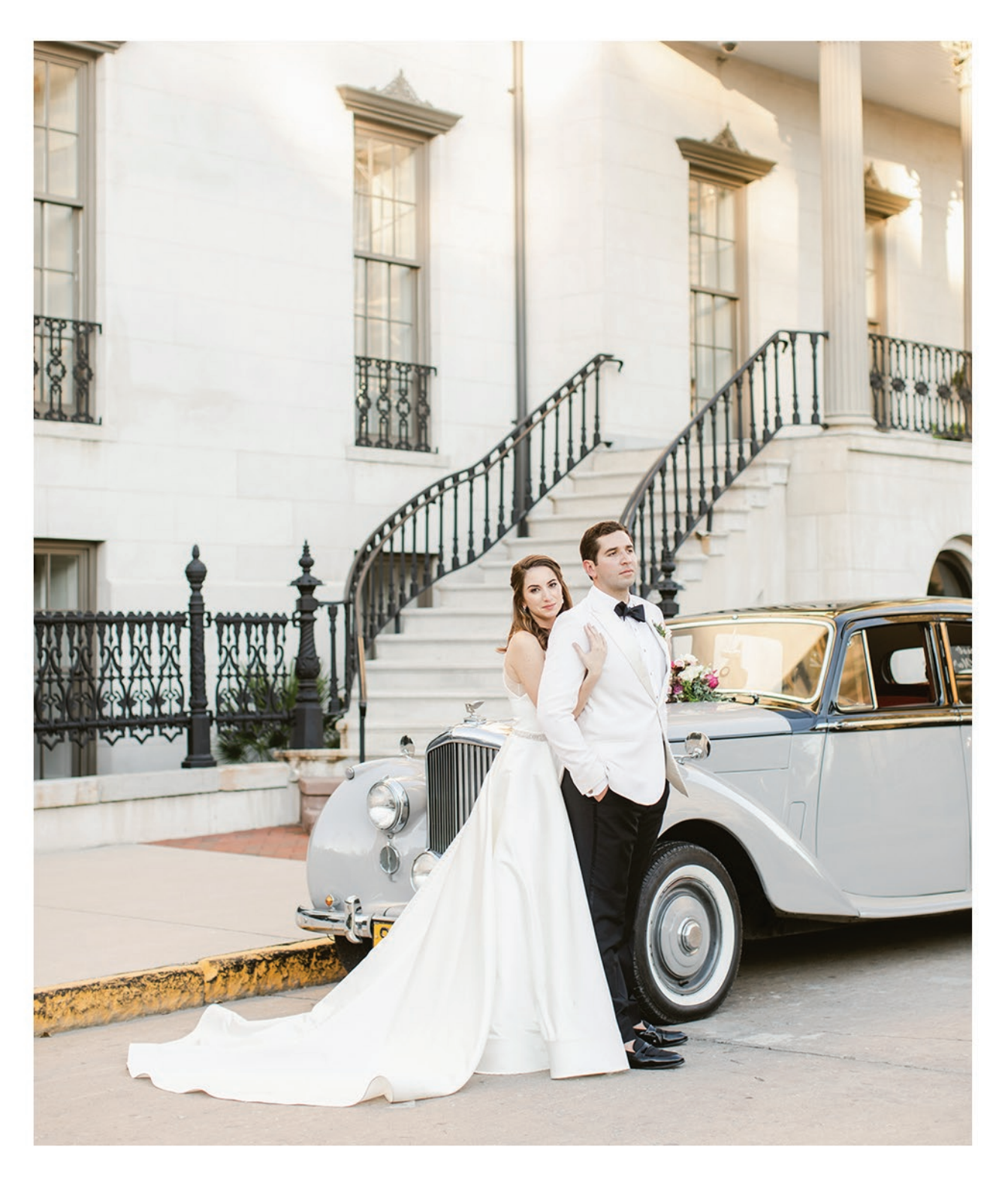
weddings + dopements · 2022