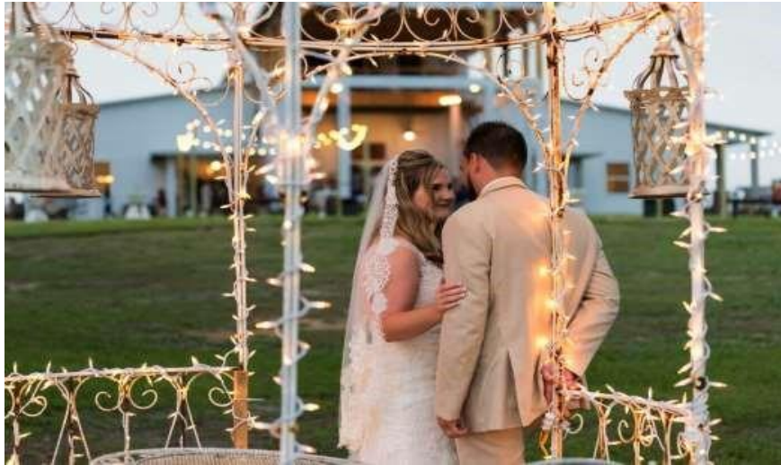
Pole Barn for Cocktail Hour