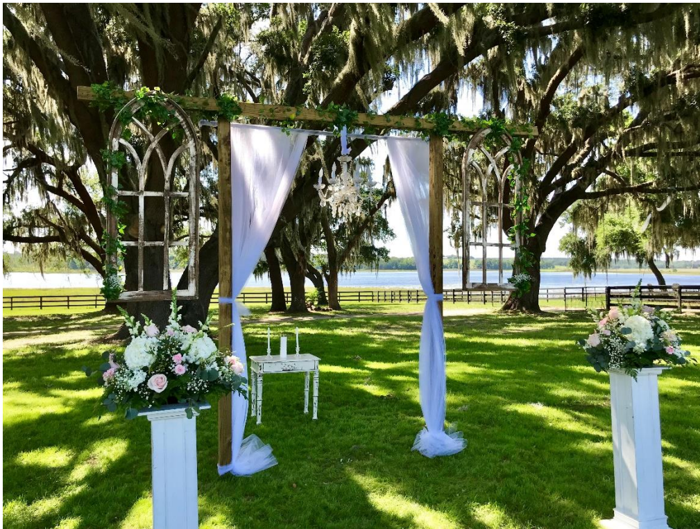
Outdoor Ceremony Site

** Holidays may be subject to higher rate**