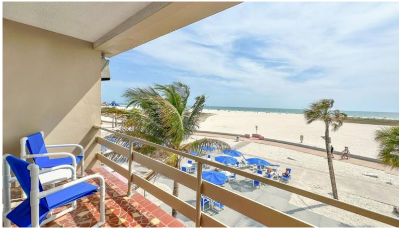
Gulf Front Room