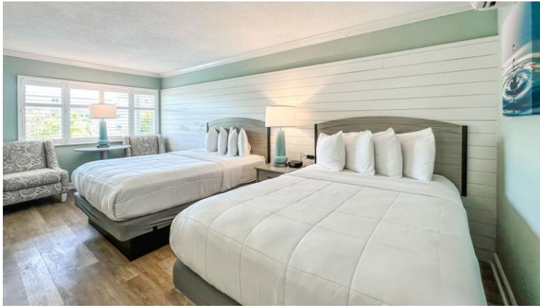
Poolside Room (Standard)