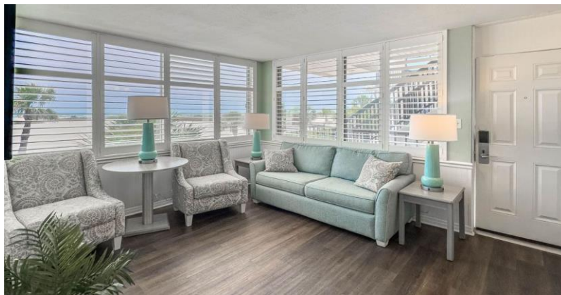
Gulf Front Suite