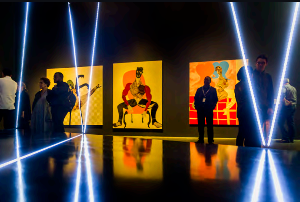
Exhibition view: "Trigger: Gender as a Tool and a Weapon" 2017.

Take advantage of our renowned exhibitions by including a private tour at your event. Led by highly trained New Museum docents, our tours offer clients an added cultural experience to their event.