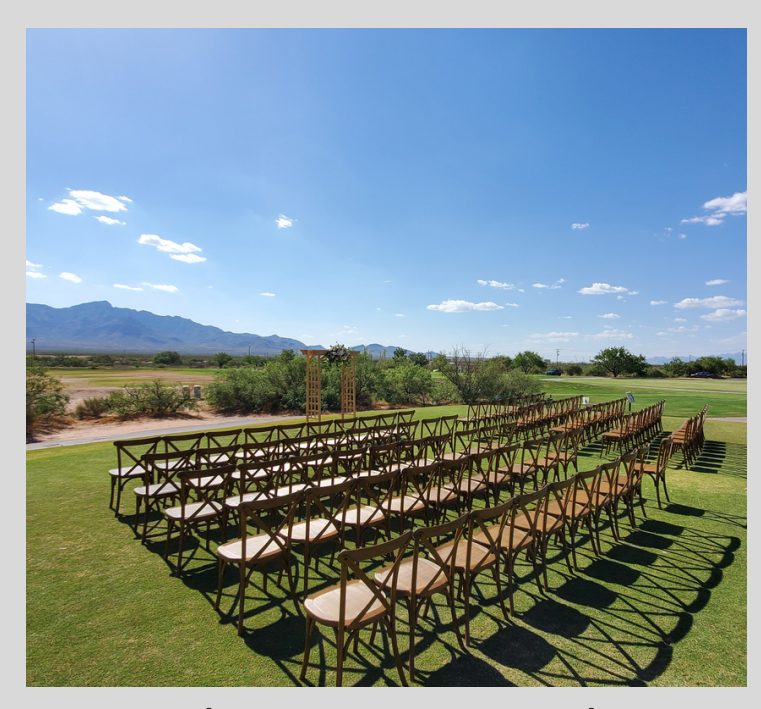
Friday & Sunday

With the backdrop of The Franklin Mountains there is no other way to say "I do".