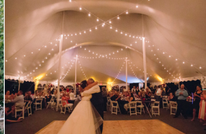
White Pine Pavilion