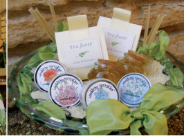
Favors and Gifts