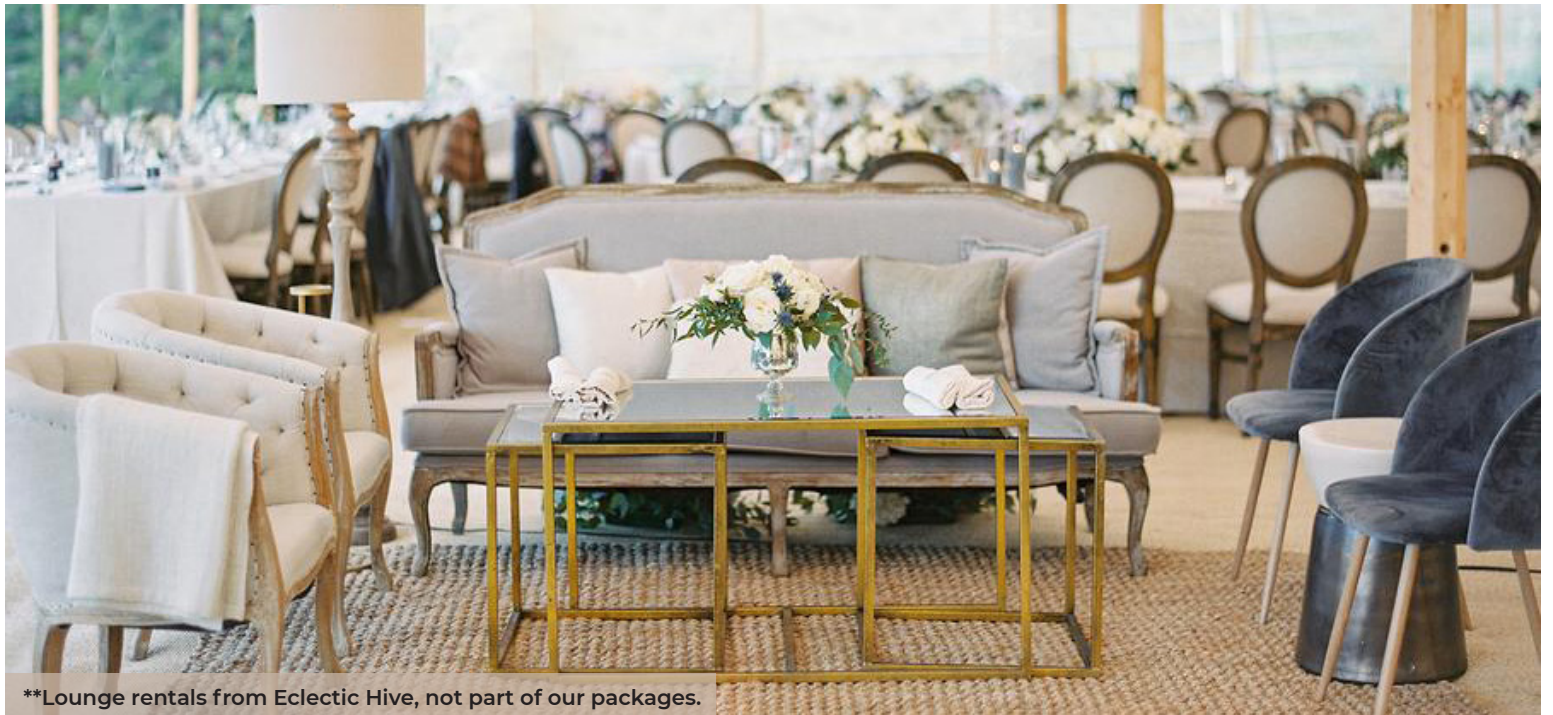
**Lounge rentals from Eclectic Hive, not part of our packages.