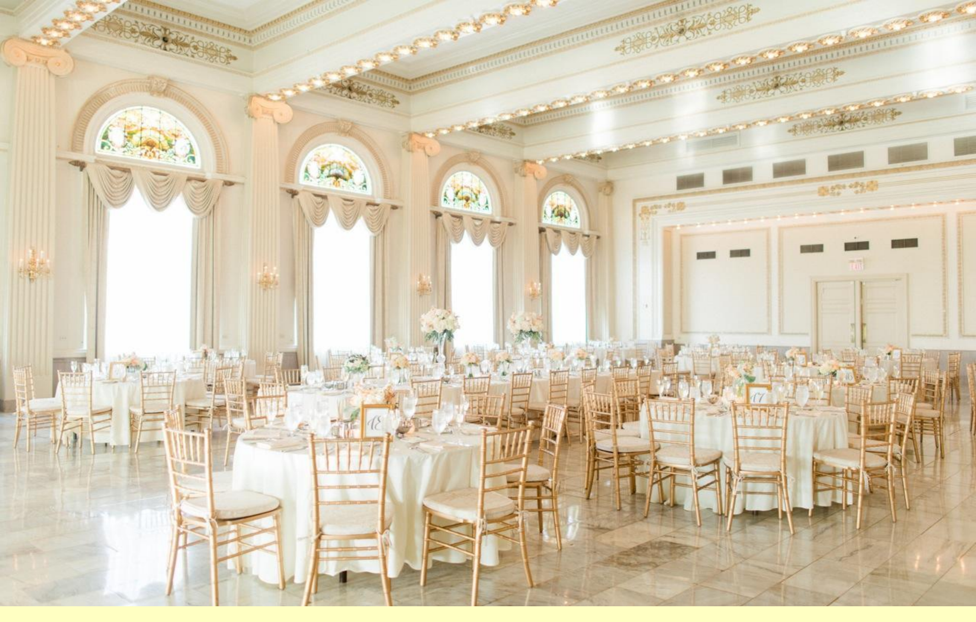
The Westin Great Southern Columbus Wedding Menus