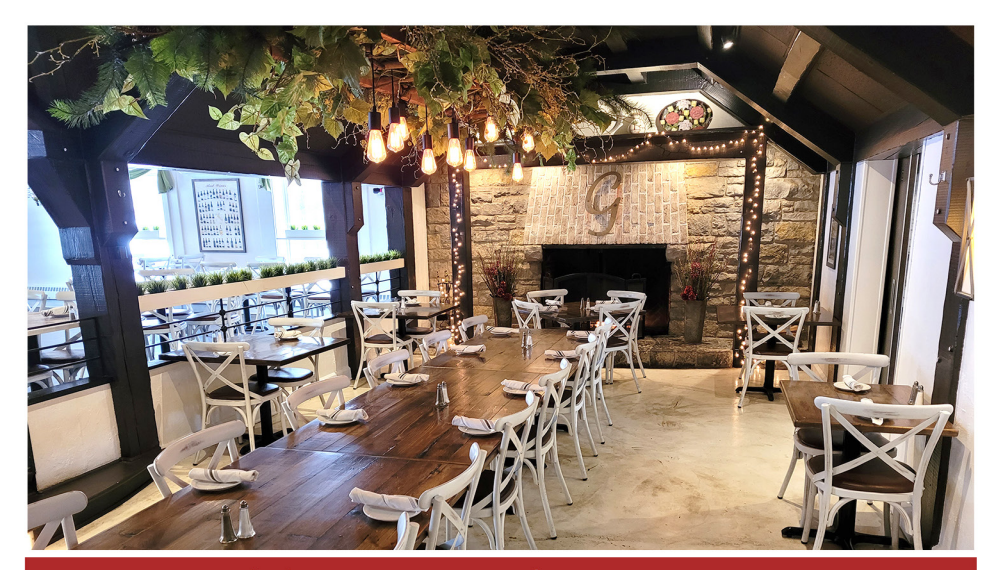
The Fireside Room The Fireside Room is semi-private and can seat up to 26 guests.