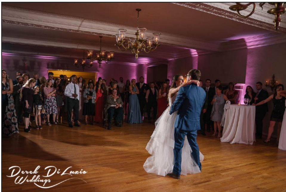
Above: Our up lighting package can help transform your event space by using LED par cans to projecting pops of color through out your wedding venue. Colors can be custom matched to your wedding palette.