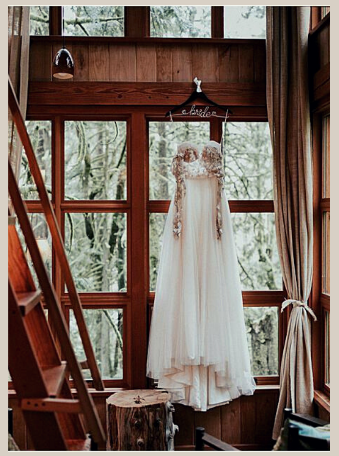
LIFE IN MOTION PHOTO + FILM

The TreeHouse Point parking lot is small, guests are encourages to carpool when possible and a <u>shuttle</u> <u>service</u> is required for any wedding over 20 guests.