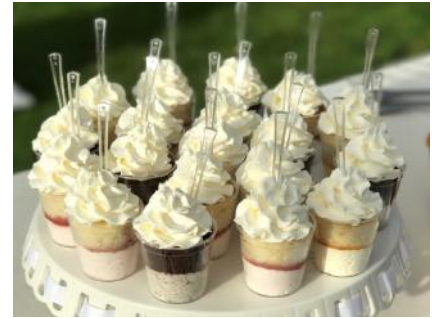
Cake Shooter Tray