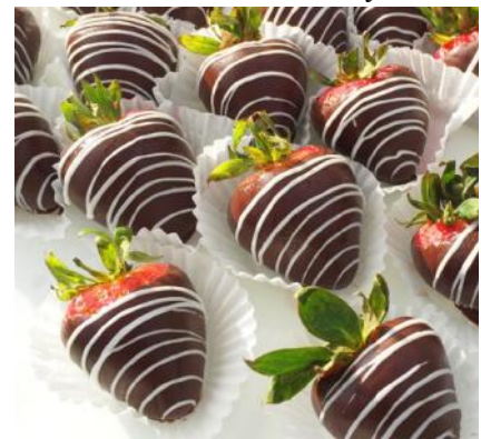
Drizzled Chocolate Covered Strawberries