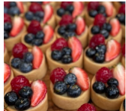
Fresh Fruit Tarts