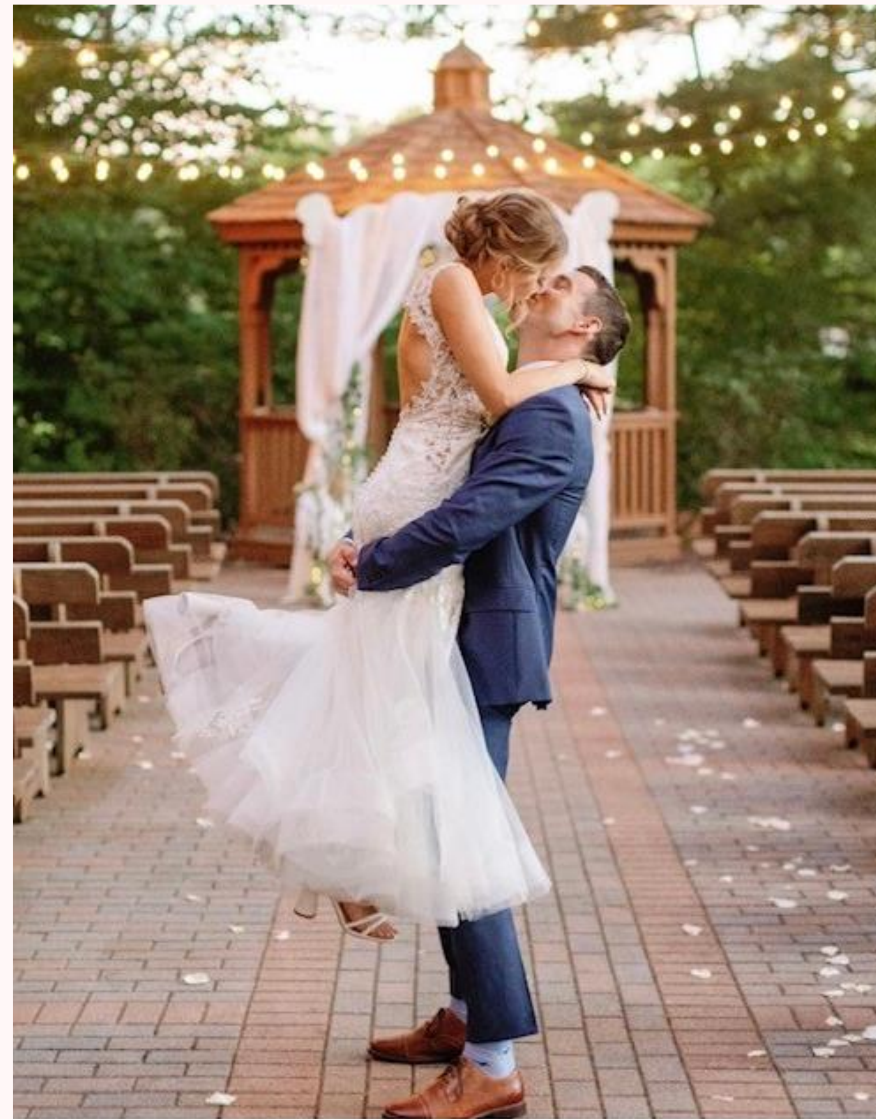
Chameleon Brides Philosophy

We Love Being a Part of Your Wedding Journey