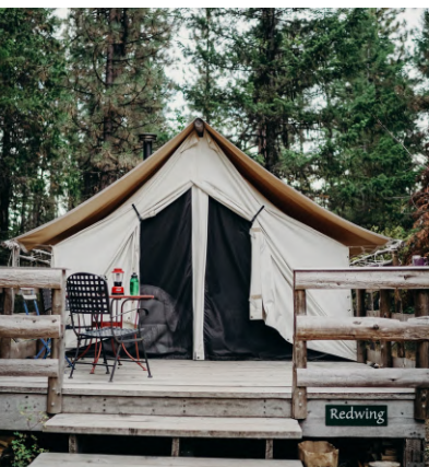
Campground Wall Tents

3 day rental of Campground, Meadow House & Farmhouse Studio