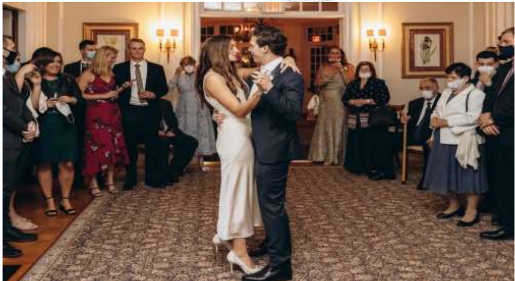
Dancing inside the mansion