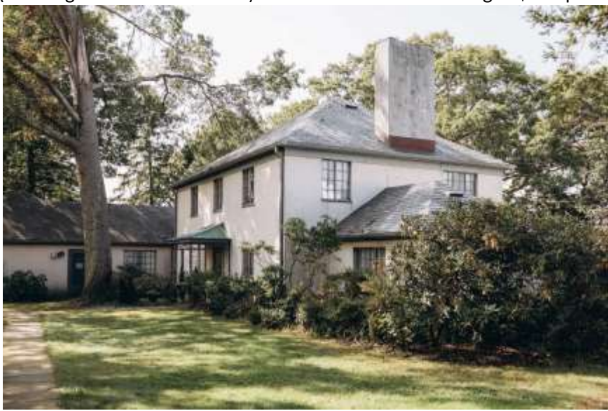
Bartleby & Sage @ The Wainwright House www.bartlebyandsage.com

Lodging on Site : The Fonrose House (pictured) sleeps 16 with a full kitchen, dining – living room, patio, five bedrooms and three full baths starting at $1,300 per night; the Carriage House sleeps 8 with four bedrooms (two single beds in each room) and two bathrooms starting at $200 per room per night.