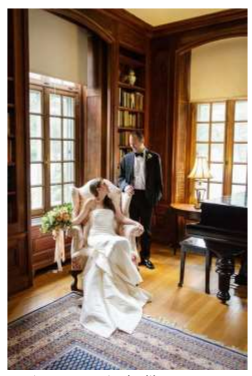
A quiet moment in the library