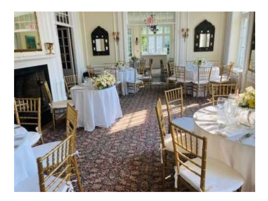
Wedding for 50 – 120 in the mansion

Bartleby & Sage @ The Wainwright House www.bartlebyandsage.com