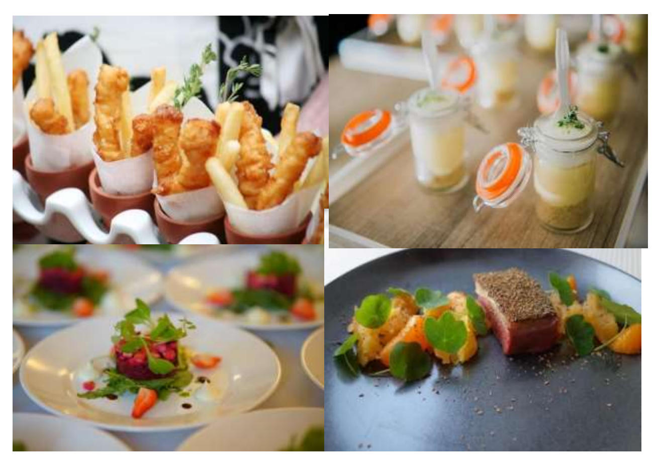
Bartleby & Sage @ The Wainwright House www.bartlebyandsage.com

From $220 - $240 per person with a five-hour open bar included From $180 per person with non-alcoholic beverages (client provides all alcoholic beverages)