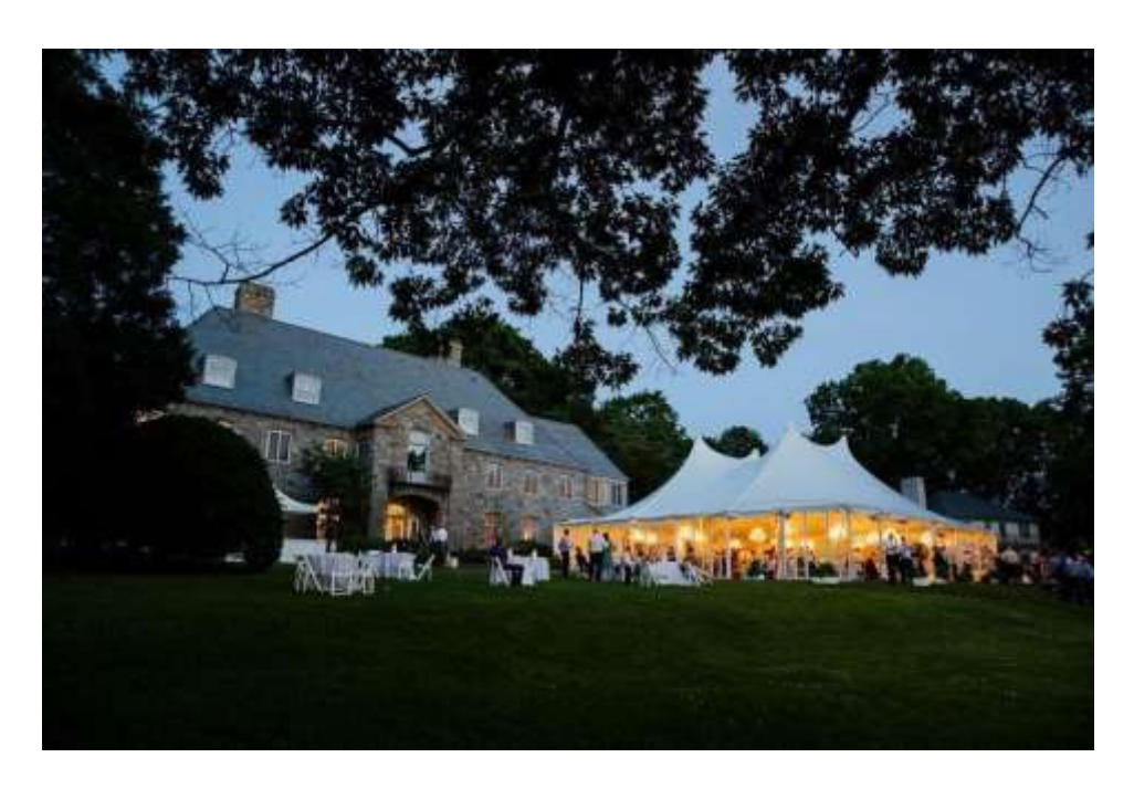
Bartleby & Sage @ The Wainwright House www.bartlebyandsage.com

The tent is very spacious with 10 ft high sidewalls and a 30 ft ceiling. It is situated on a level 60' \times 60' foot lawn with clear views of the water and can accommodate up to 240 guests with dancing . White folding chairs, 60'' round tables, China, cutlery, glassware, bars, and cocktail tables are included in the pricing along with the tent. There is limited availability for large, tented weddings, which book far in advance. (Sold out for 2023 for 160 - 240 guests).