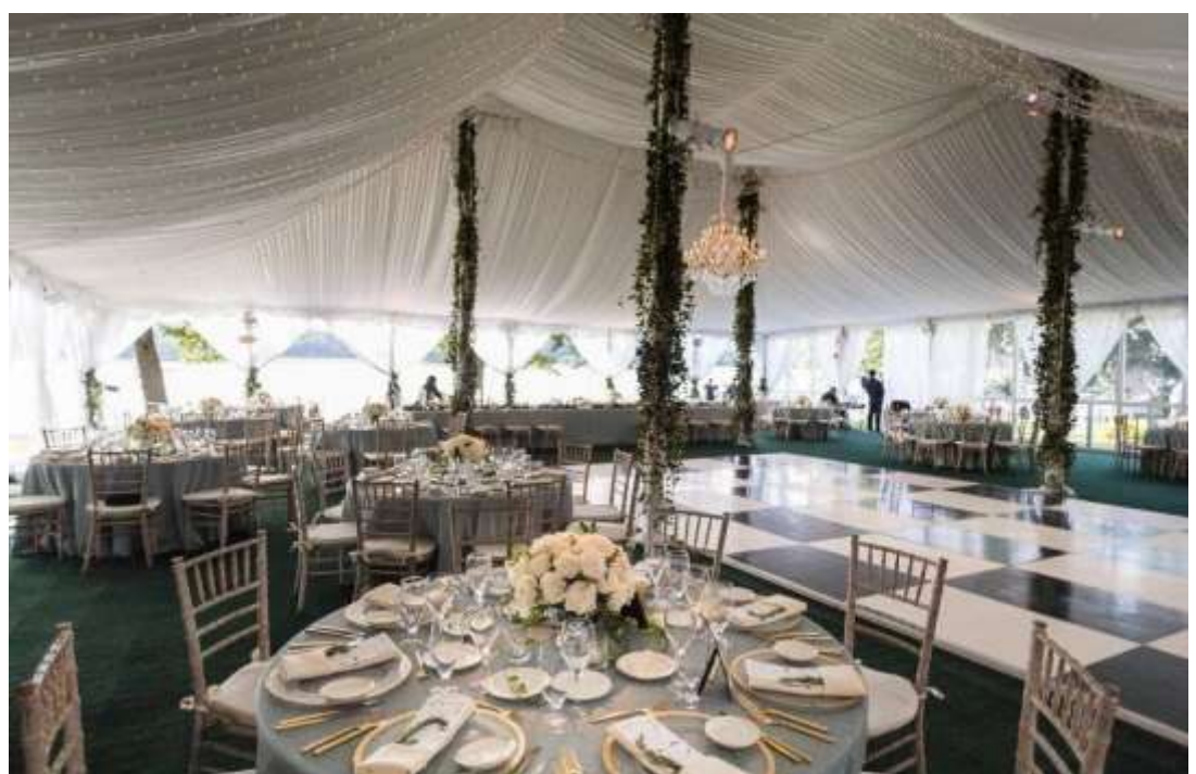
Bartleby & Sage @ The Wainwright House www.bartlebyandsage.com