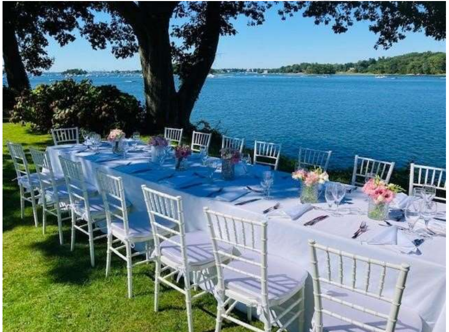
Intimate dinner by the water