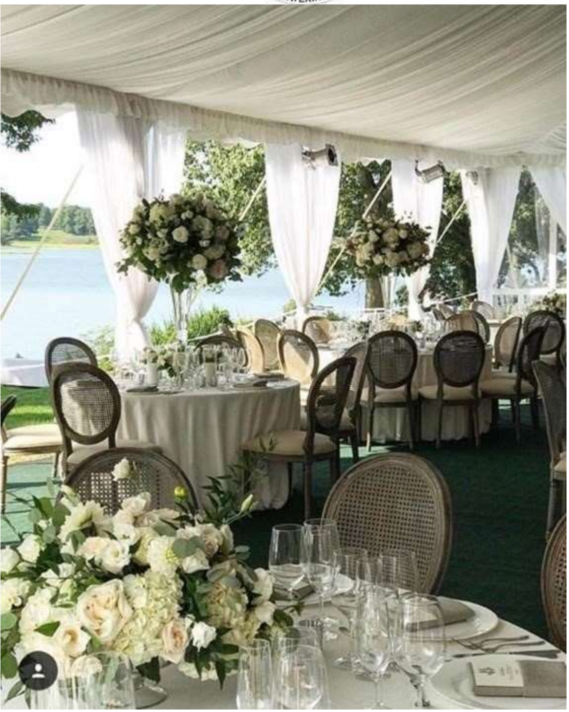
Bartleby & Sage @ The Wainwright House www.bartlebyandsage.com