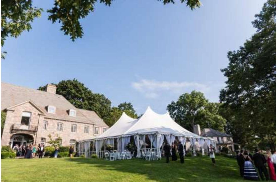
The tent during cocktail hour