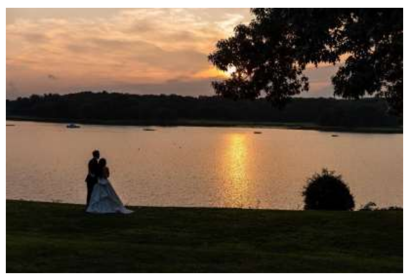
The most romantic sunsets

Bartleby & Sage @ The Wainwright House www.bartlebyandsage.com