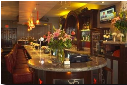
Voted Best Restaurant 2015