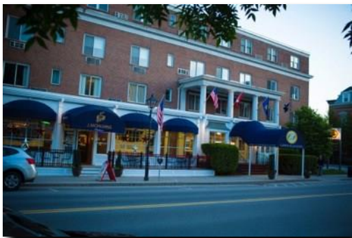
Voted Best Hotel 2015