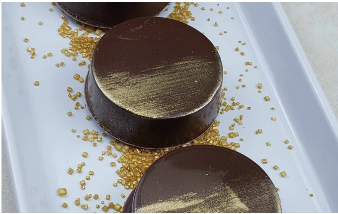
Chocolate Covered Oreos: $2.00 each