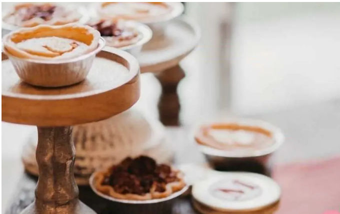
Mini pies : $3.00 each

(buttermilk, apple, peach, lemon, blueberry)