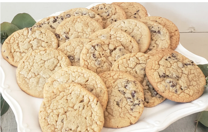
Cookies: $2.00 each

(chocolate chip, chocolate peanut butter chip, peanut butter, snickerdoodle and sugar cookies)