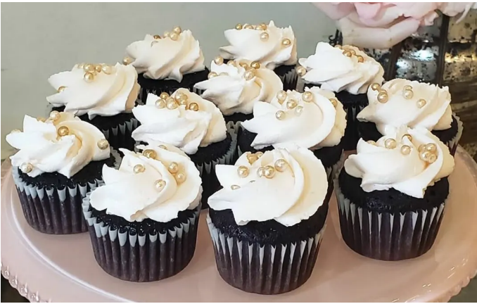
Mini Cupcakes: Start at $1.00 each