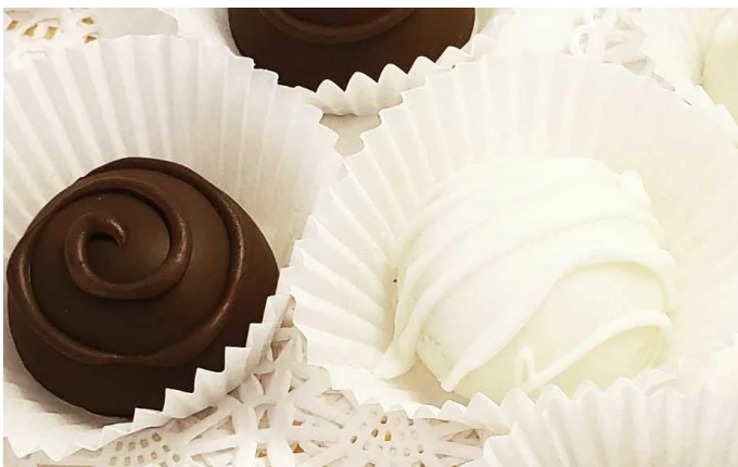
Truffles: $1.50 each

(buttermilk, apple, peach, lemon, blueberry)