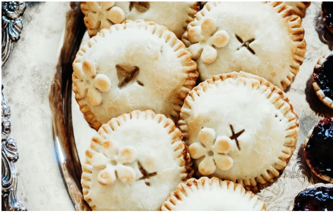
Hand pies : $3.00 each