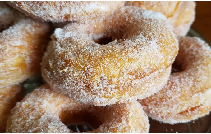
Sugar Doughnuts: $2.00 each