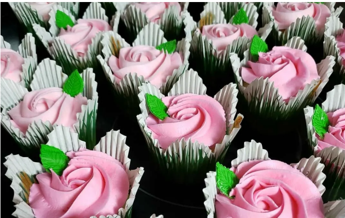
Standard Cupcakes: Start at $2.00 each