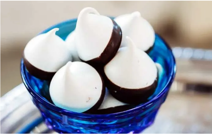
Meringues: Start at $1.00 each