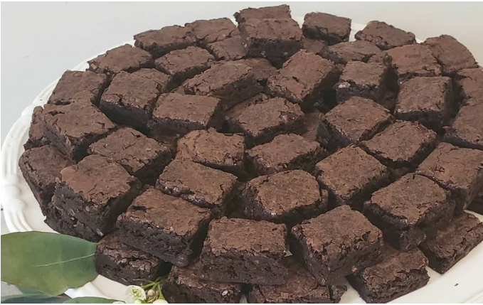
Brownie Bites: $1.00 each