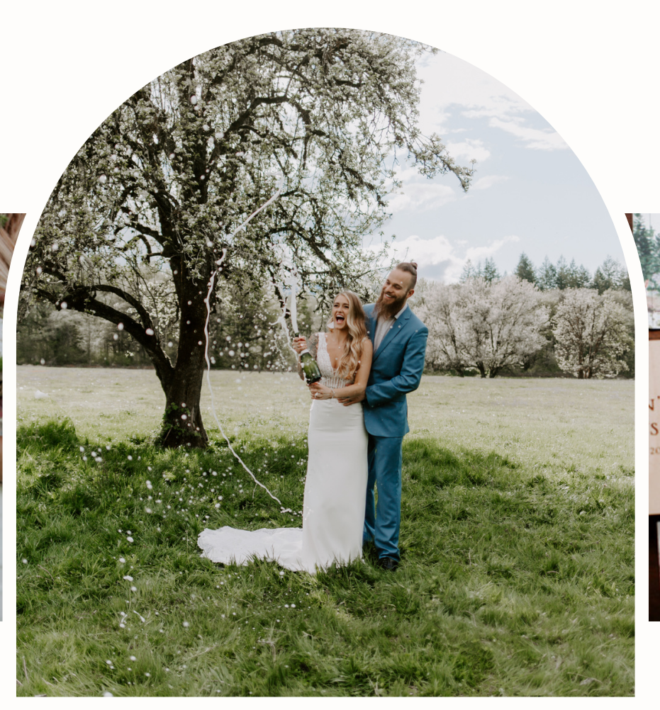
Package & Pricing Guide