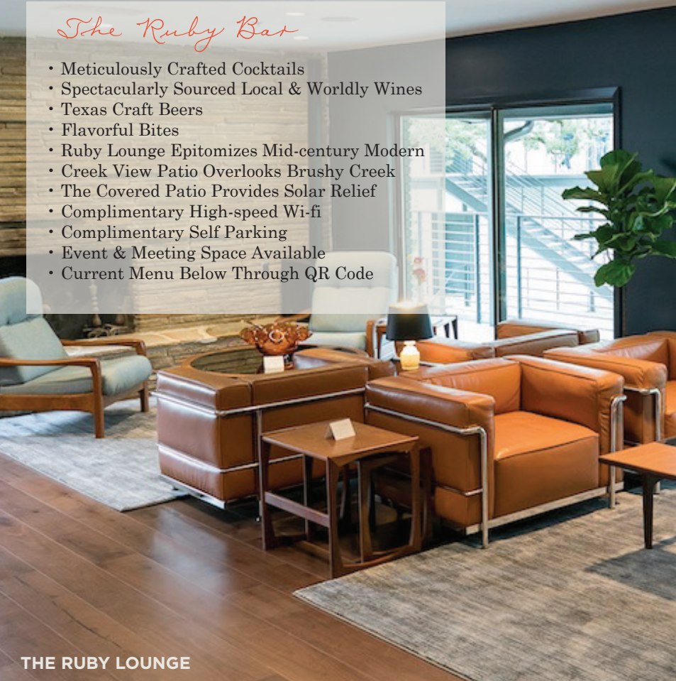
THE RUBY LOUNGE