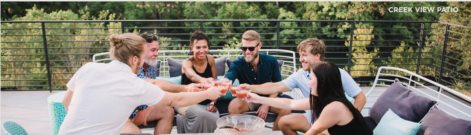
CREEK VIEW PATIO