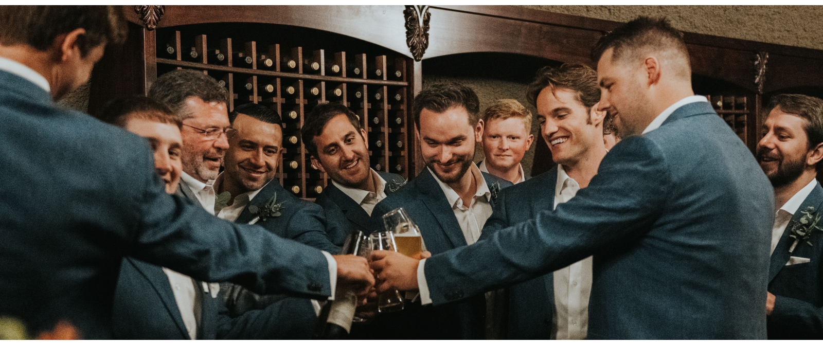
Standard Hosted Bar - $25.00 per person Estate wine collection + 2 beer selections

Each hosted bar will include 6 wines, 3 white and 3 red. Wine selection is determined prior to your event based on the wines currently available. The bar will open after the ceremony, and will close 30 minutes prior to the end of the wedding reception.