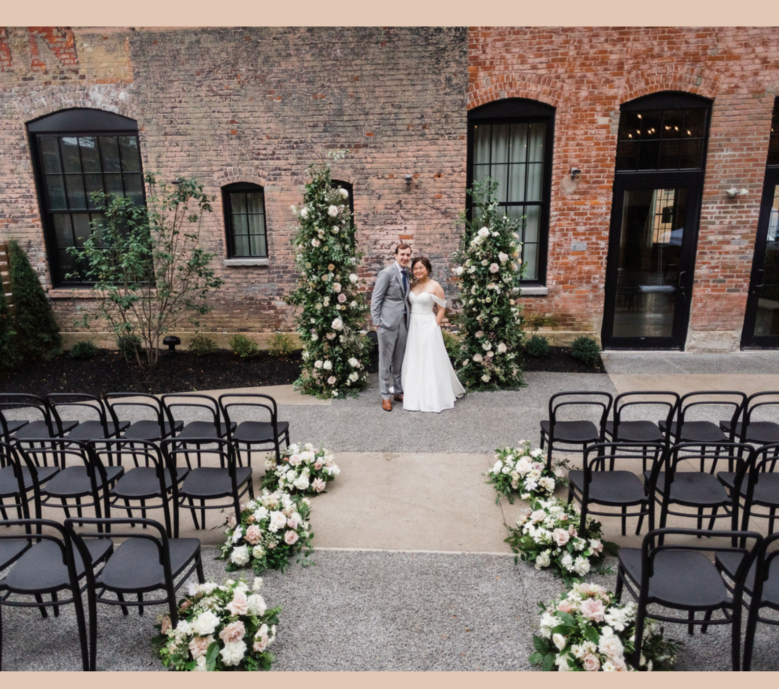
Includes chairs, set-up and tear-down, additional time at the venue, DJ, and microphones.