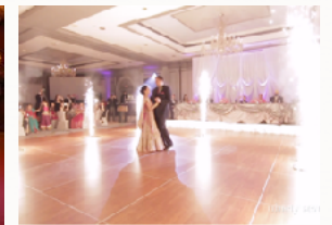
Cold Sparklers: $250 each, Pairs of 2+ recommended