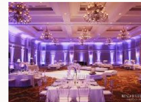
Uplighting: $25/light with $150 setup fee.

Music for Pre-Ceremony, Ceremony, Cocktail Hour + Reception. Consultation to map out the Soundtrack to Your Wedding. Premiere Sound Equipment: Dual Speakers, Wireless handheld Microphone for Officiant during Ceremony + Toasts during Reception. Mixer. Dance Lighting. Emceeing Event. Arrival 2 Hours before music begins.