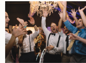
*Wedding prices vary based on time & equipment needs

Music for Cocktail Hour + Reception. Consultation to map out the Soundtrack to Your Wedding. Premiere Sound Equipment: Dual Speakers, Wireless handheld Microphone for Toasts during Reception, Mixer. Dance Lighting. Emceeing. Arrival 1.5 Hours before music begins