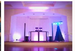
Dual Speakers, Dance Lighting, Facades included