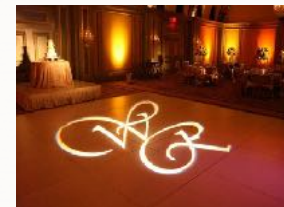
Custom Spotlight: $450

Uplighting Photo Booths Custom Spotlight with couple's names, initials, dates, company logos etc Projector Screen with Photos and Video Memories Cold Sparklers