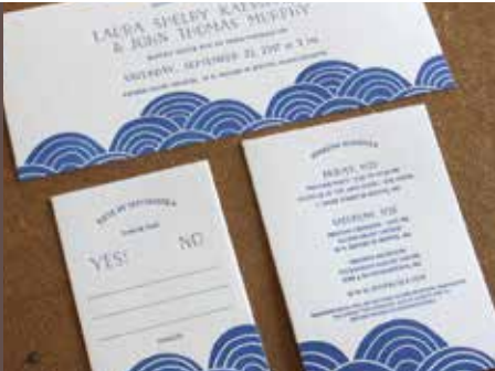
150 Sets of 9.5 x 4 Invitations, 3.5 x 5 Reply Cards, 4x6 Details Cards, printed in PANTONE 3005 on Lettra Fluorescent White 110# $735