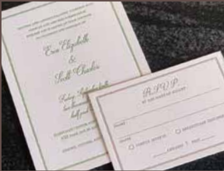
100 set A7 Invitations (PANTONE 363) & 4-Bar Reply Cards (PANTONE Cool Gray 9) on Lettra Fluorescent White 110# $420