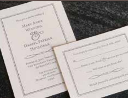
DIY Run, Reflex Designed; 120 sets A7 Invitations, A2 Reply Cards (PANTONE Warm Gray 8) on Colorplan Natural 100# $770