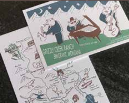
DIY Run, DIY Designed; 200 Sets of A7 Invitations & A9 Map (Custom-Mixed Gray, Blue, Brown & Green) on Lettra Fluorescent White 220# $1217