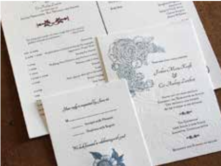
100 Sets of A7 Invitations (PANTONE 7459, Black & Blind), Letter-Size Programs (PANTONE 704 & Black), & A2 Reply Cards (PANTONE 7459 & Black) on Rives BFK 250gsm $1540