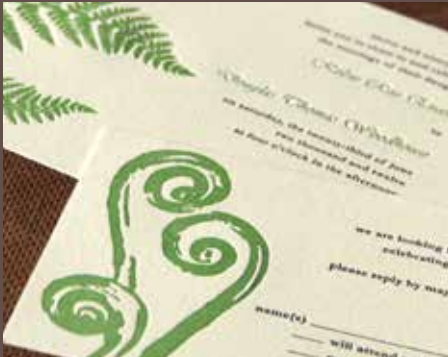
80 Sets of A7 Invitations & Reply Cards (PANTONE 349 & Black) on Lettra Ecru 110# $655